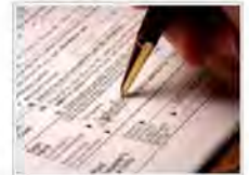
NEWS USA Tax Relief for Unemployed and Those With Decreased Income on 2009 Returns